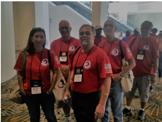
NALC Branch 704 Delegates at the 2018 National Convention in Detroit, Michigan.