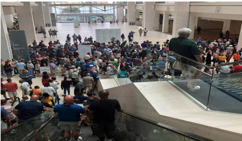
MEET & GREET AT THE 2018 NATIONAL CONVENTION