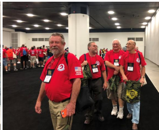
VETERANS HELPING VETERANS